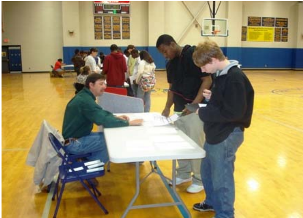
Students view payment options for monthly utilities